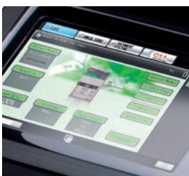
7.0 inch LCD colour touch screen.

A 7.0 inch touch screen colour LCD with thumbnail previews and convenient stylus pen, for example, makes everyday operation simple and intuitive. We've even added easy-grip handles to the paper drawers.